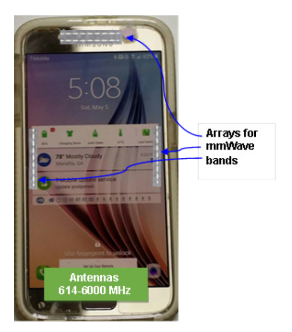
Fig. 1. Proposed antenna arrangement on a smartphone.

Implementation of TWA as a body-wearable device for Army wideband network handheld handsets has been successfully demonstrated [8]. For 5G the 3D TWA will be shrunk to about 1/5. Fortunately, like other cellphone antennas, for lower frequencies it serves essentially as a launcher; the body of the cellphone is the actual radiator.